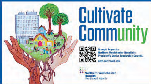
2021 Cultivate Community