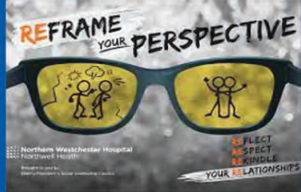
2018 Reframe Your Perspective